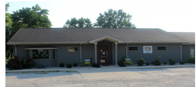
7432 Olson Rd., Leiters Ford, IN 46945 • 574-542-4859