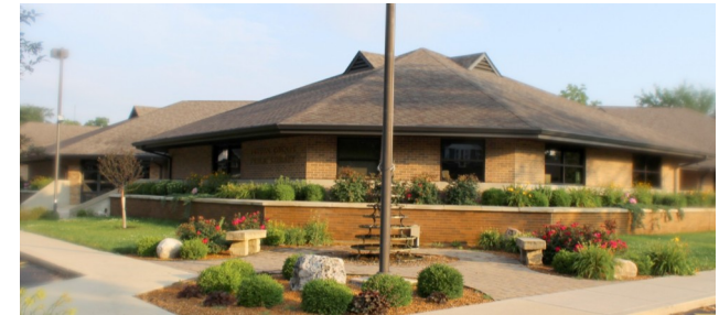
320 W. 7th St., Rochester, IN 46975 • 574-223-2713