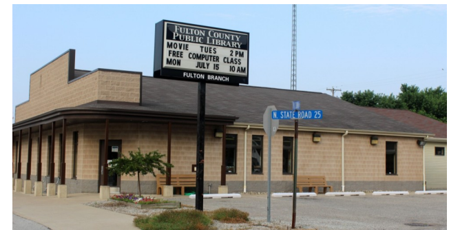
7420 Liberty Ave., Fulton, IN 46931 57 • 574-857-3895